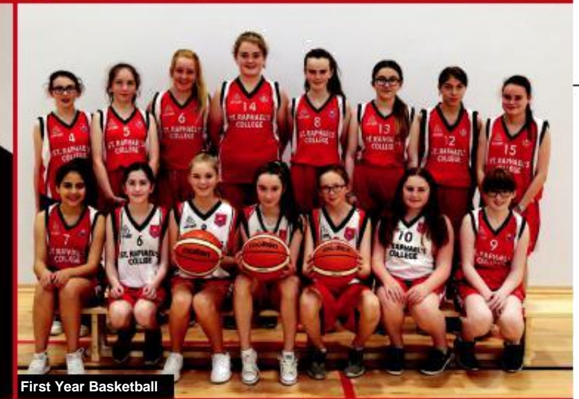
First Year Basketball