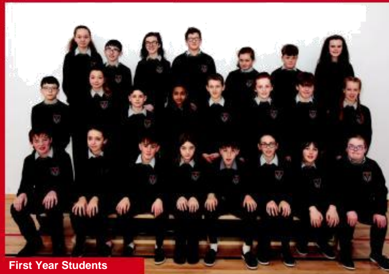
First Year Students

Homework is an integral part of school life and the learning process. It is important that parents ensure that homework is completed every evening. Homework should be written into the school journal at the end of every class. Journals should be checked by parents every evening and signed at least once a week. Tutors will check student journals regularly and they may also be collected from students prior to Parent Teacher Meetings. It is important that students get into good study habits from the beginning of first year. They should have a quiet place free from distraction where they can study.