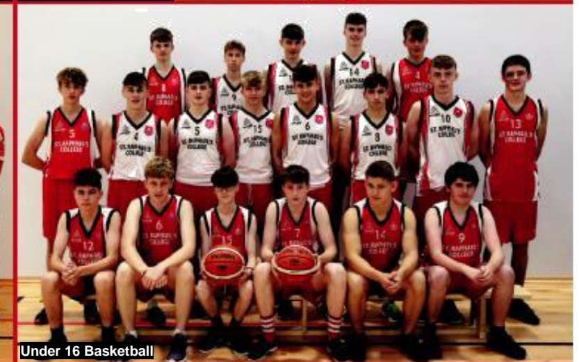
Under 16 Basketball