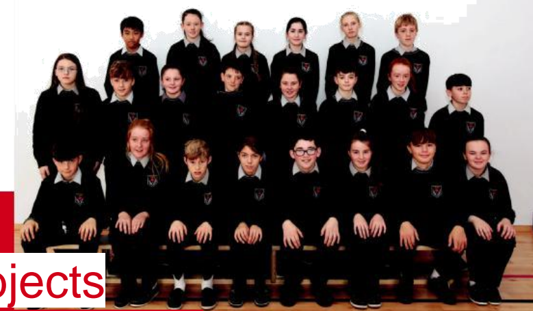
First Year Students