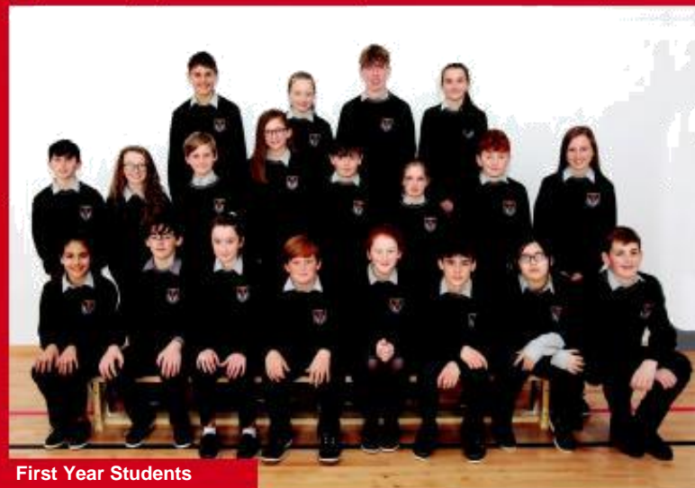
First Year Students