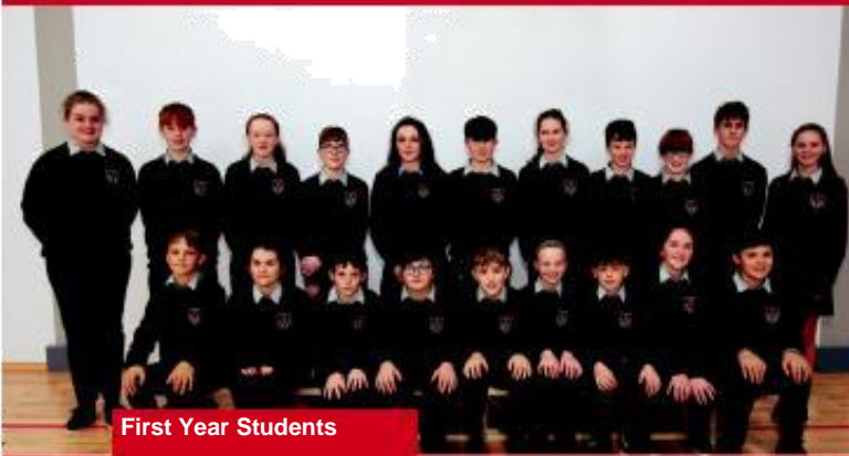
First Year Students