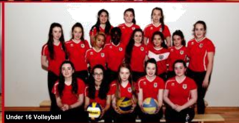
Under 16 Volleyball