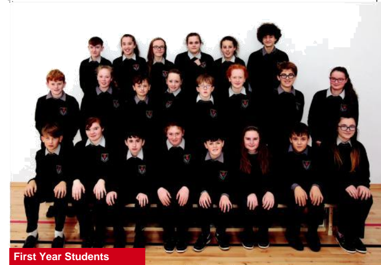
First Year Students