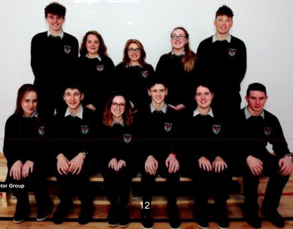
Peer Mentor Group

Retreats suitable to a particular age level of pupils are carefully planned as part of the R.E. programme. These retreats provide students with an opportunity to reflect on their relationship with God and his meaning in their lives today. Retreat centres include, Knock, Esker, Ballintubber and Tobar Nua.