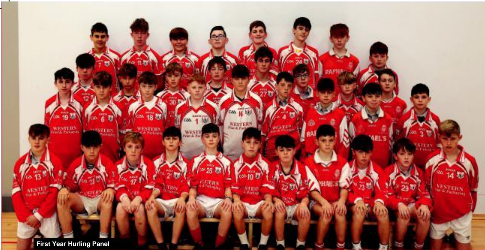
First Year Hurling Panel