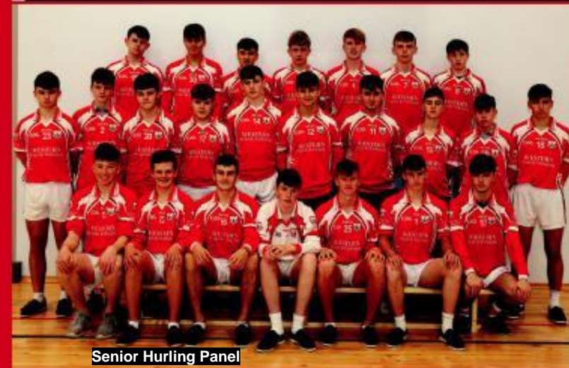
Senior Hurling Panel