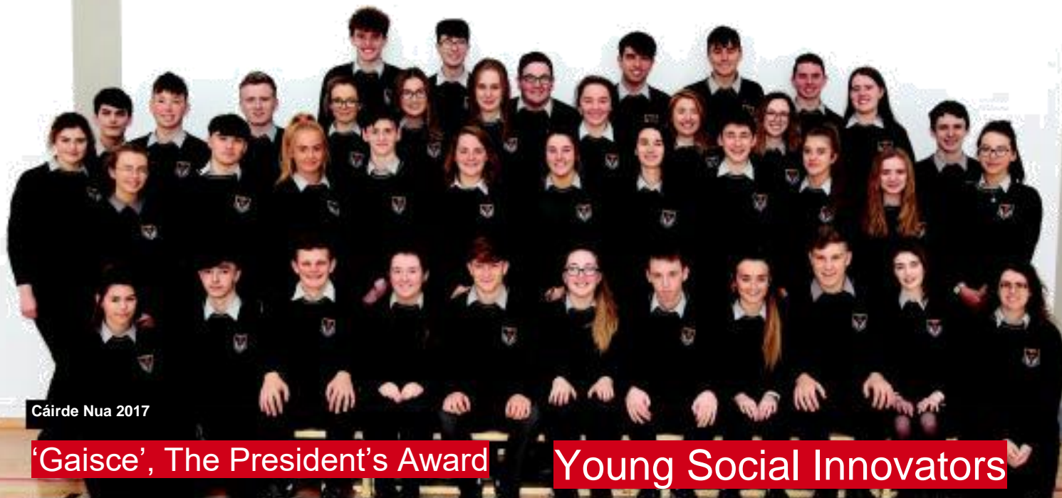
Cáirde Nua 2017