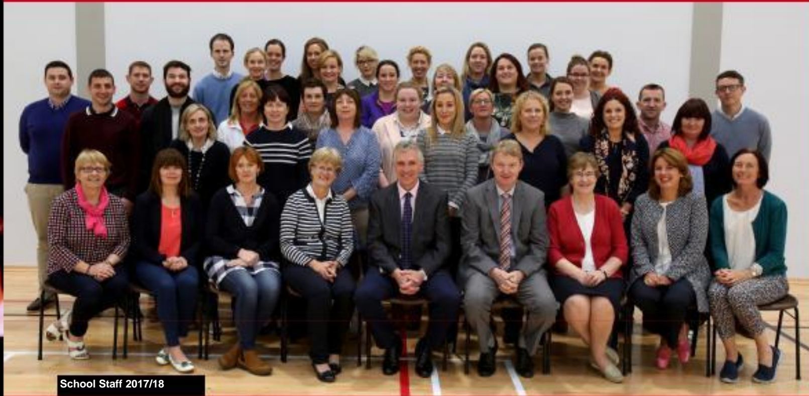
School Staff 2017/18